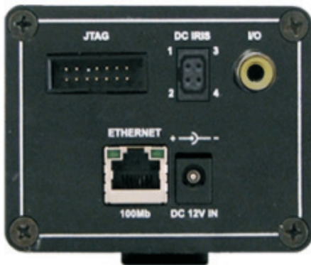
MatCam rear view